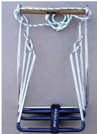
DI3 – 3 Steps