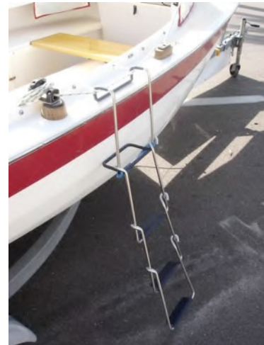
Decked Boat Mount